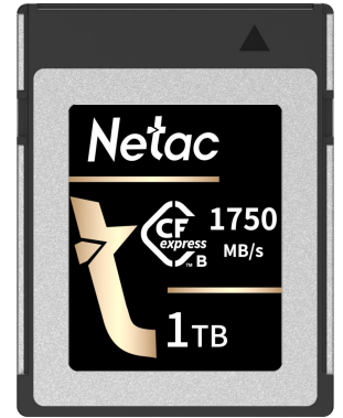
CF2000 CFexpress™ Type B Card